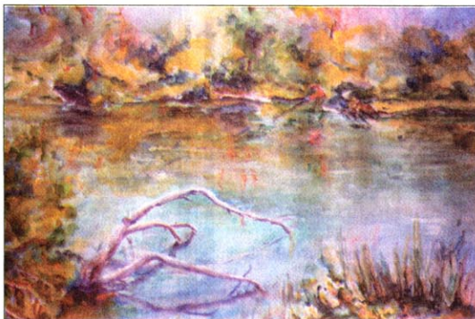
WHISKEY CREEK: "Being out there in the early morning hours trying to capture the nuances of light and shadow and the many colors of Florida's landscape is watercolor heaven," Levy said. Artwork courtesy of Natalie Levy

For more information, call 954-797-1044.